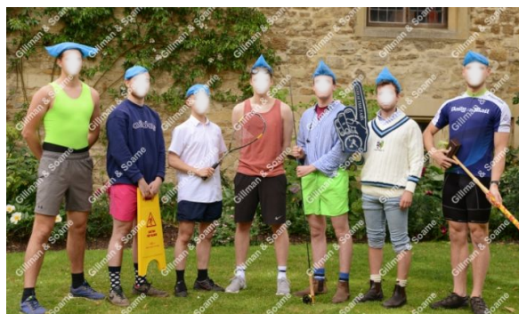
The Lincoln Squash team, apparently

IN THE NEXT ISSUE – A report on Lincoln's new underwater polo team!